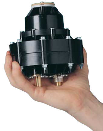
The unique Drester diaphragm pump specifically designed to handle solvent, comes with a 4-year warranty.